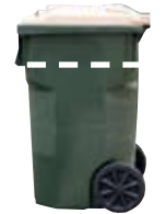
Fill level on larger household bins